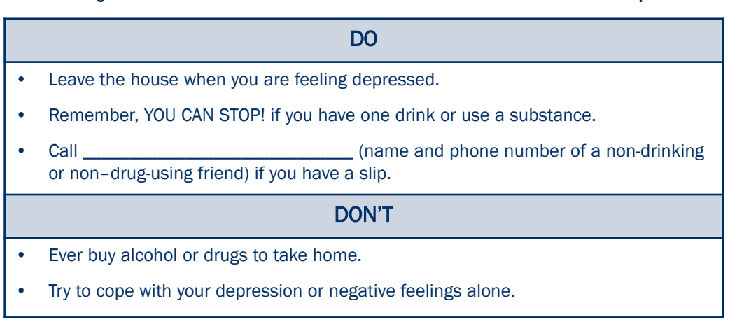
Figure IV-13. Do's and Don'ts To Remember if You Have a Slip

Provide each client with a 3- x 5-inch index card of Figure IV-13. Instruct clients to review this card if a slip occurs or when they find themselves in a situation that may lead to a slip.