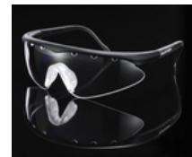
Black Knight Turbo Black Eye Guard (Available in Small or Regular)