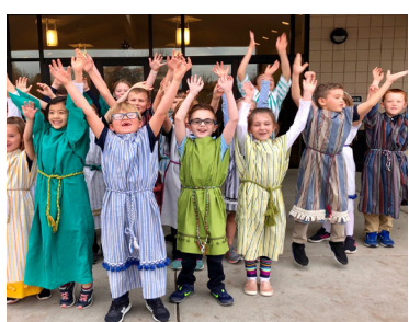
Israelites fleeing Egypt!