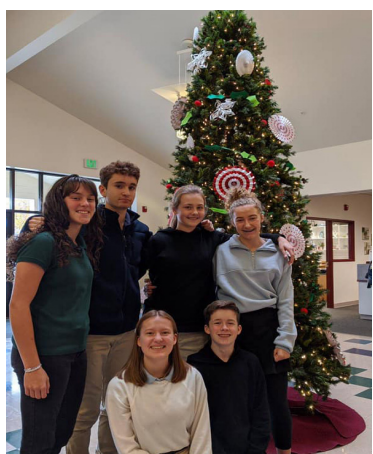
8th grade officers