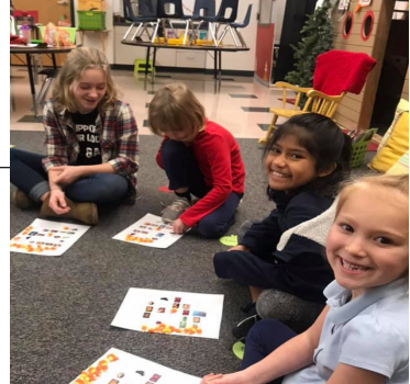
BINGO for Family Groups