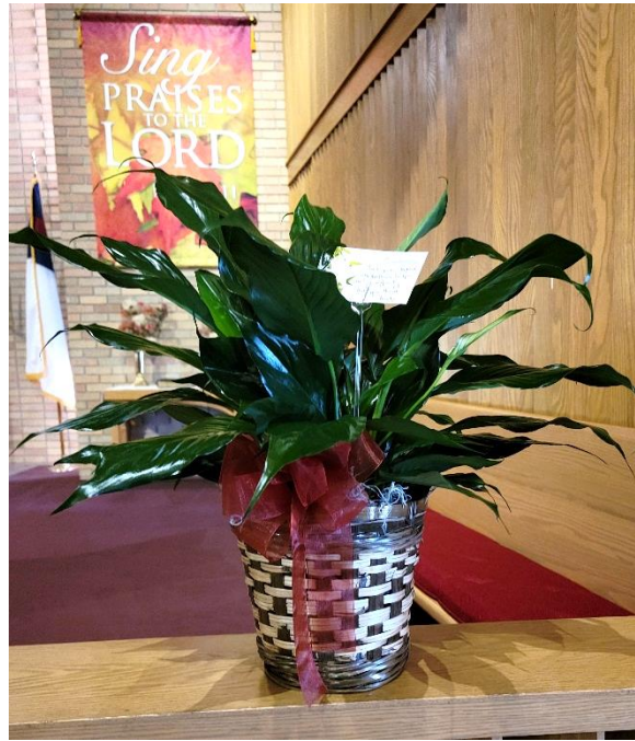
Sending our deepest sympathies to you and your family.