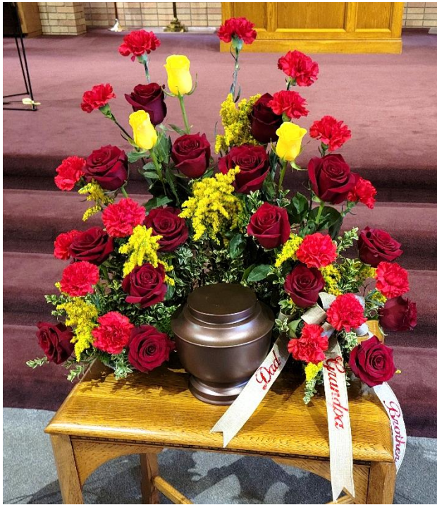
Dad ~ Grandpa ~ Brother