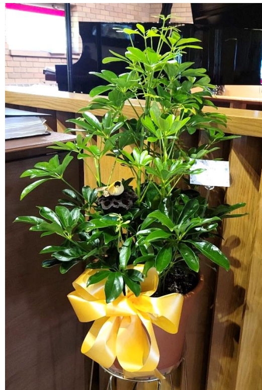
Air Guard Fire Department C-Shift