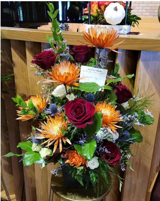
Freeman Regional Health Care