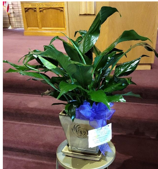
With love & sympathy, your brothers & sisters in Christ at Grace Communion Church