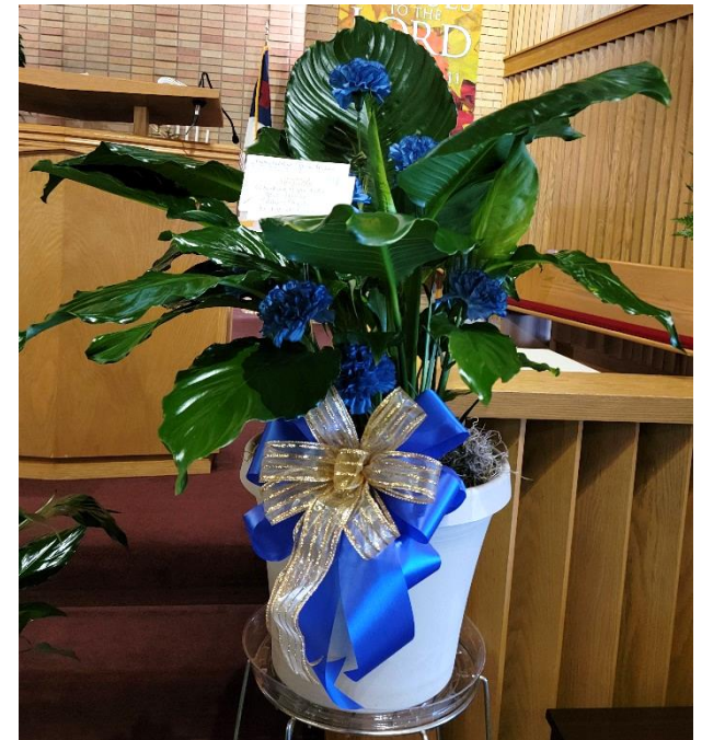
Thinking of you and your family... Lady Eagles Basketball Team