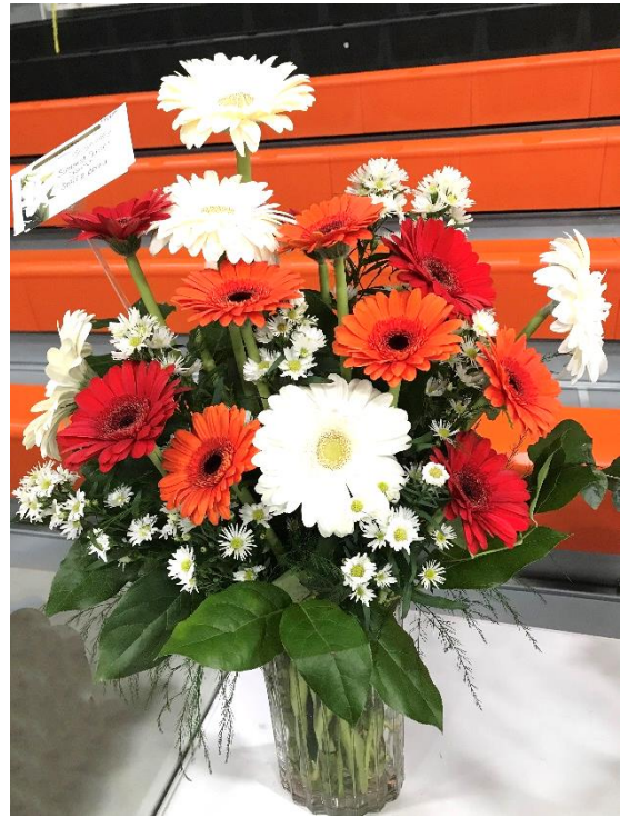
Scotland School District Staff & Board