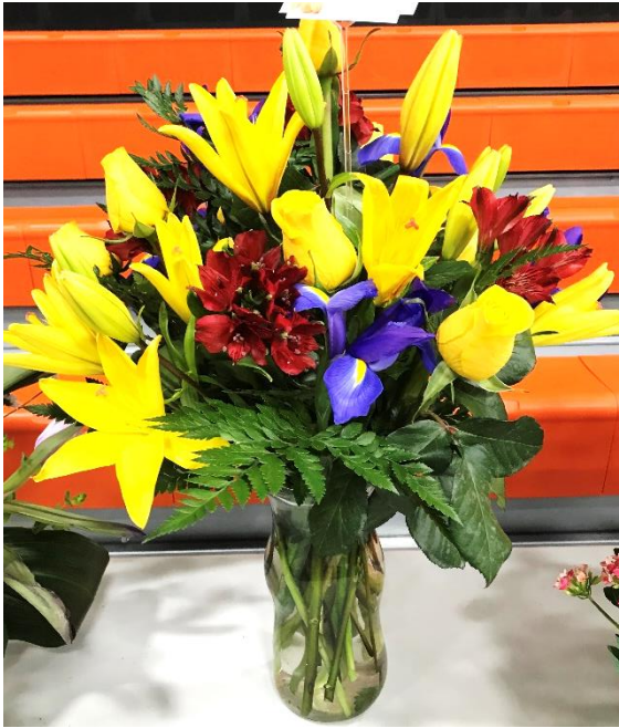
Class of 2016