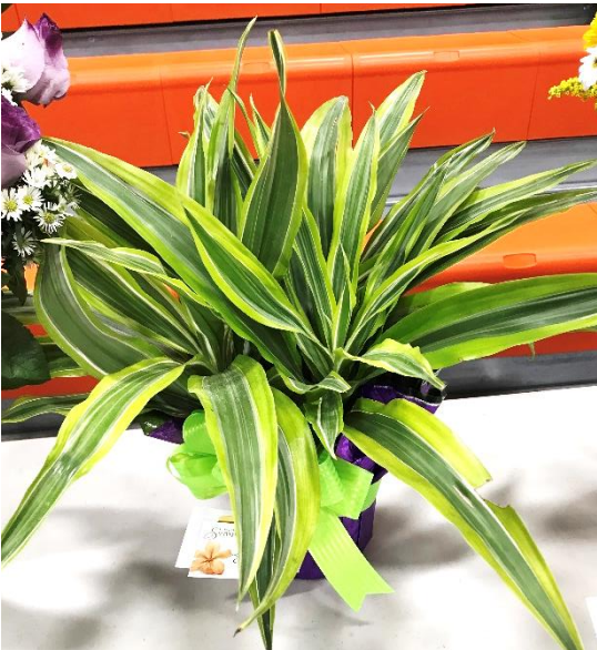
We miss you Pep. -SHS Student Council & Student Body