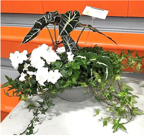
Scotland High School Class of 1990