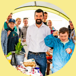
Minister Joe O'Brien Department of Rural & Community Development

When you feel part of a community those challenges are easier to manage - you can keep them at bay."