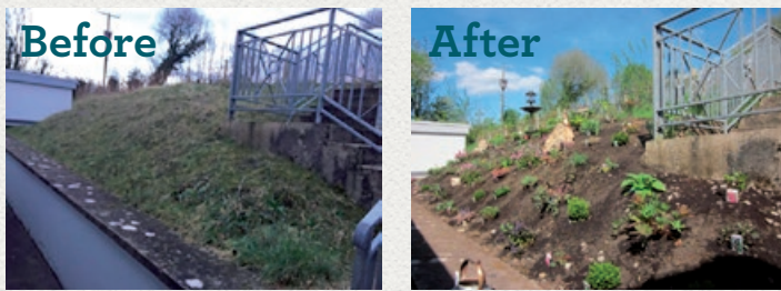
Killyhommon Primary School, Co. Fermanagh, changed a mown grass bank into a border packed with pollinator-friendly plants.