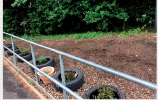
The Eco Club at St Joseph's, Co. Antrim, transformed an unused area into a bee bank and feeding station.