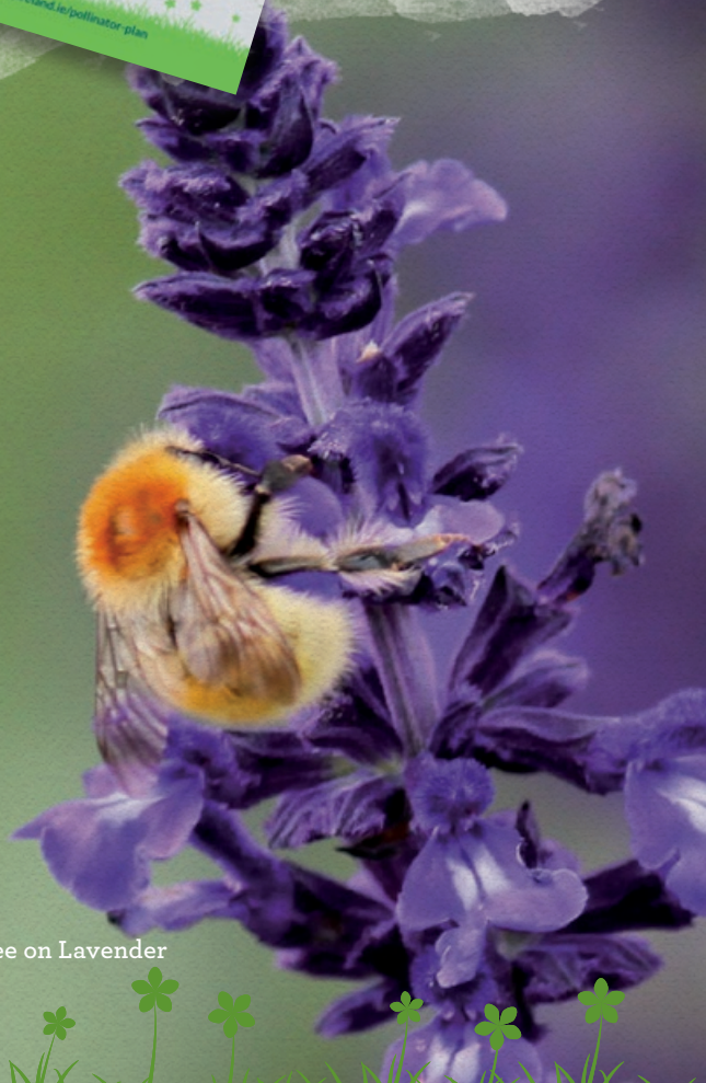
Bumblebee on Lavender