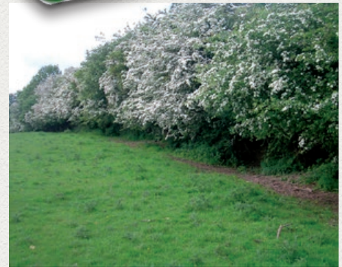
Whitethorn or Hawthorn flowers in spring

Our Native tree swatch will help you identify trees around your school