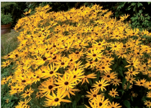
Rudbeckia is a lovely pollinator-friendly flower to plant