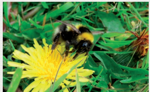
Identifying even small areas where you can let the grass grow longer will allow Dandelions and clover to flower, which offer important pollen-rich food for bees