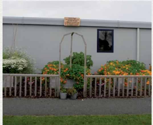
St. Annin's NS, Rosscahill, Co. Galway.

Perhaps you would like to submit your School Pollinator Plan to our website so that others can see what you have done and learn from your experience. Email your plan to: pollinators@biodiversityireland.ie