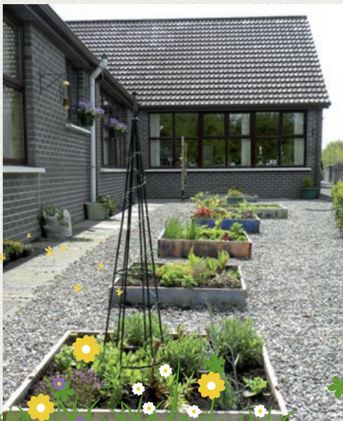
Bawnmore NS, Claregalway, Co. Galway.

Perhaps you would like to submit your School Pollinator Plan to our website so that others can see what you have done and learn from your experience. Email your plan to: pollinators@biodiversityireland.ie