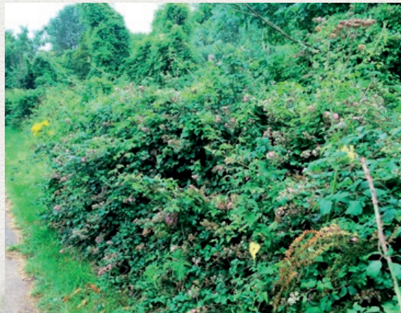
Wild area with Bramble and Ivy