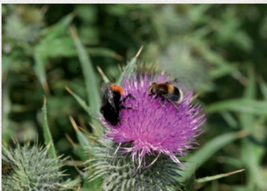
Bombus lapidarius & Eristalis intricarius