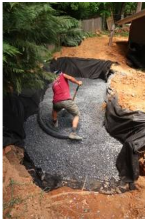
Drywell for drainage

Drainage: Being in a virtual valley, storm water management was a big concern for the Caplans and their neighbors. To address this issue, they decided to add a new 5000 cubic foot drywell to reduce storm water runoff from their addition and original structure.