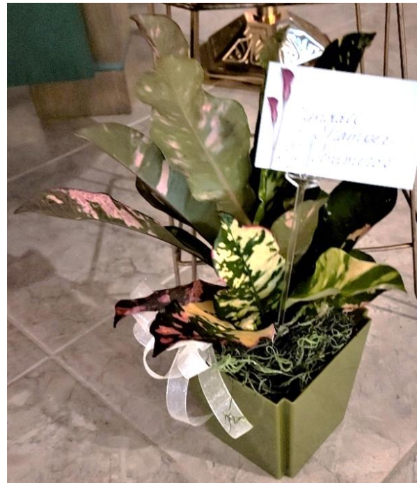
Tyndall Chamber of Commerce