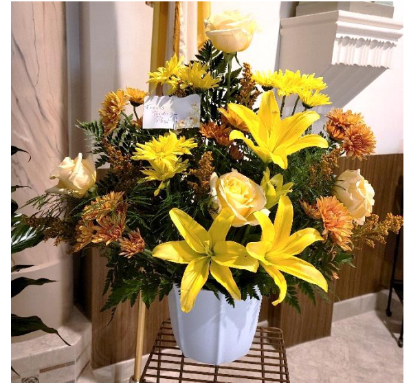
Franks Trading Post