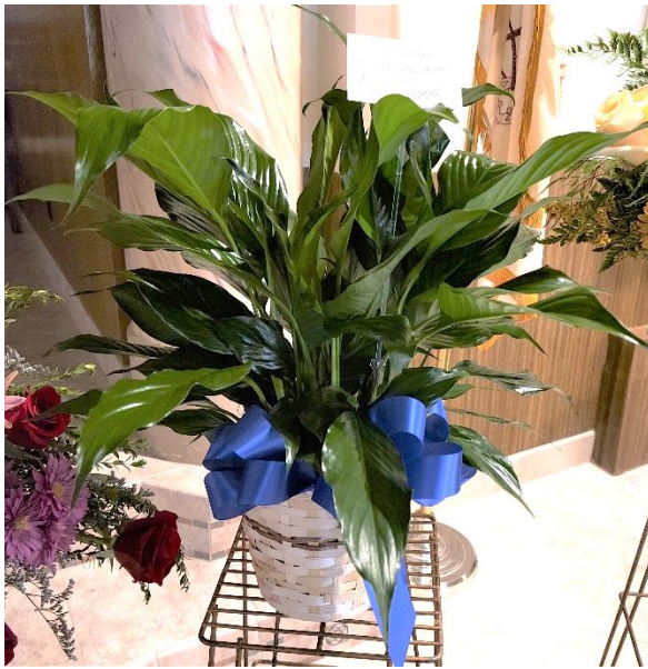
Our thoughts and prayers Tyndall NAPA