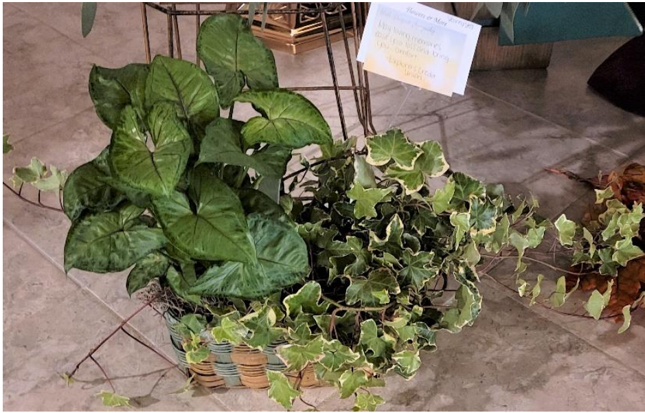
May loving memories ease your loss and bring you comfort Explorers Credit Union