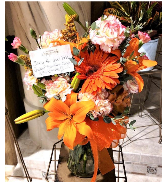
Sorry for your loss Central Farmers Coop & FREMAR LLC