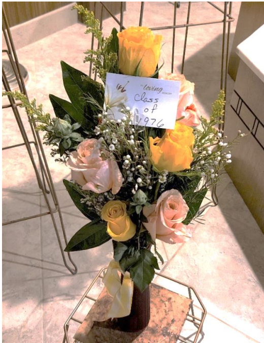
Class of 1976