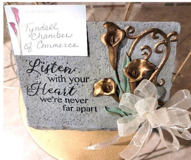
Tyndall Chamber of Commerce