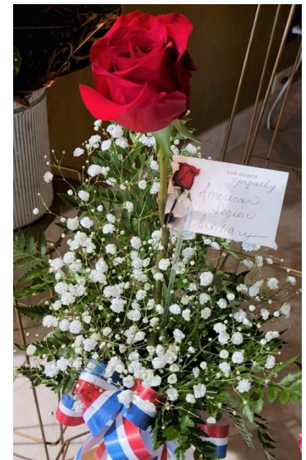
American Legion Auxiliary