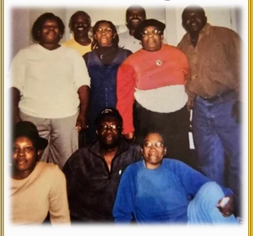
Your Sisters & Brothers