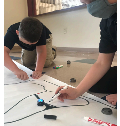
STEM activity using ozobots in 1st/2nd grade