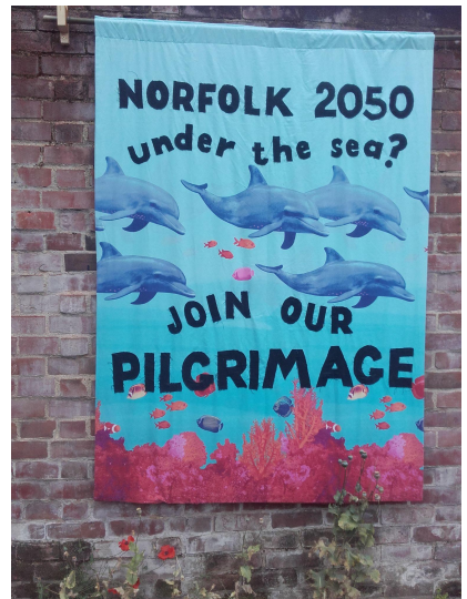
Photo: Banner outside Norwich Quaker meeting House in Goat Lane

The Norfolk Churches Trust Bike, Walk, Drive - Saturday 11th September 9-5 norfolkchurchestrust.org.uk/bike-ride