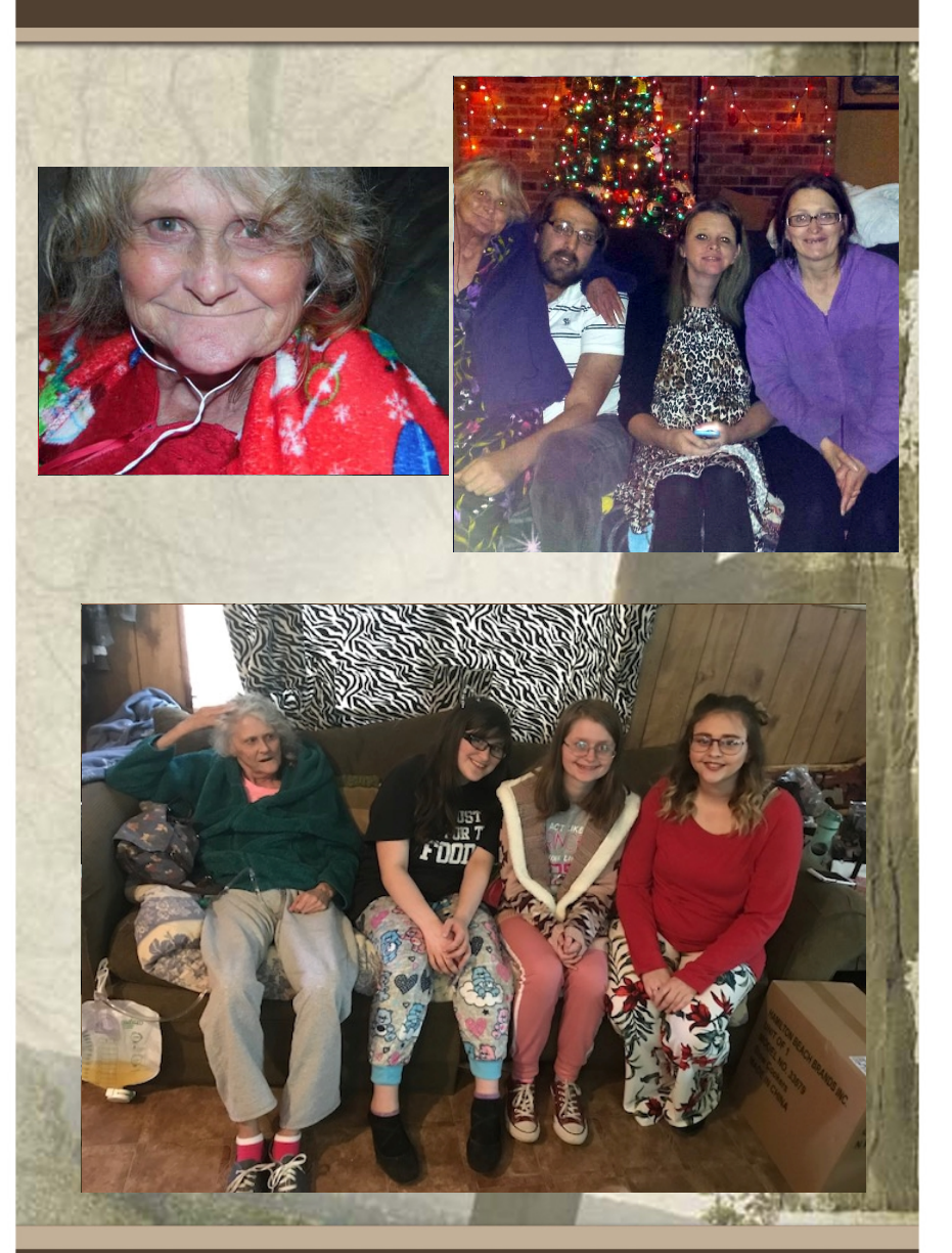
Peebles Fayette County Funeral Homes & Cremation Center Somerville and Oakland, Tennessee (901) 465–3535 www.PeeblesFuneralHome.com