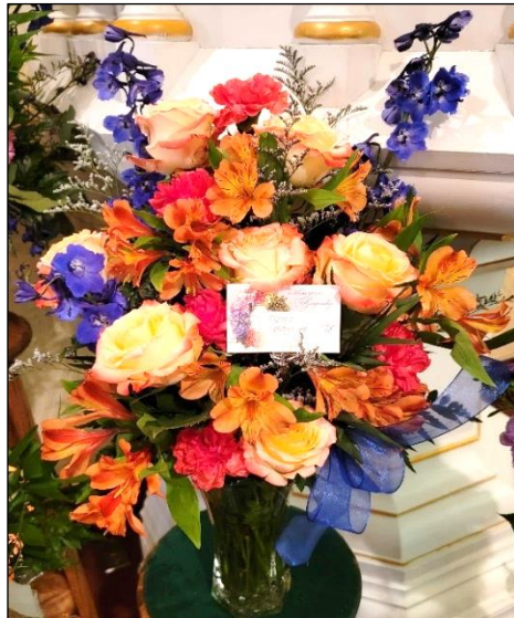
TJHS Class of 1998