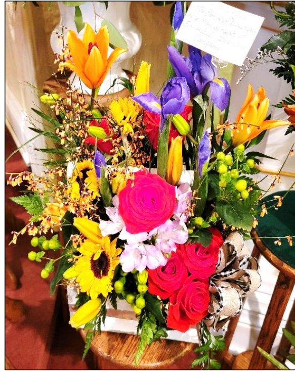
The Board of Directors and Management of Enumclaw Insurance Company