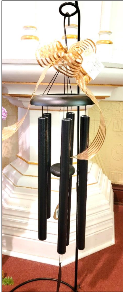
Class of '89