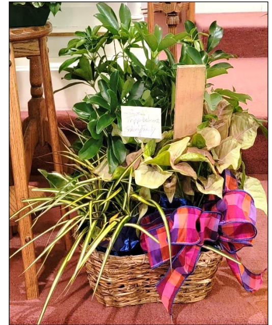
Tripp-Delmont School Family