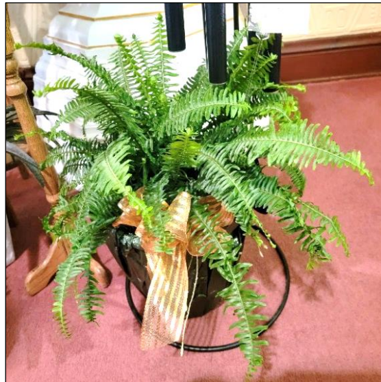
Class of '89