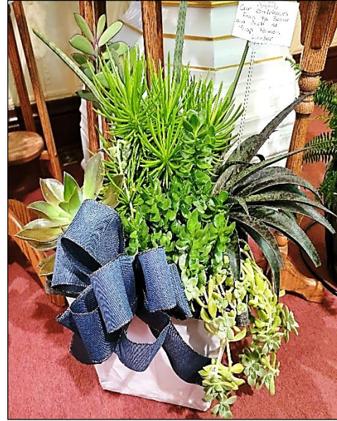
Board and Staff at Tripp Farmers Lumber