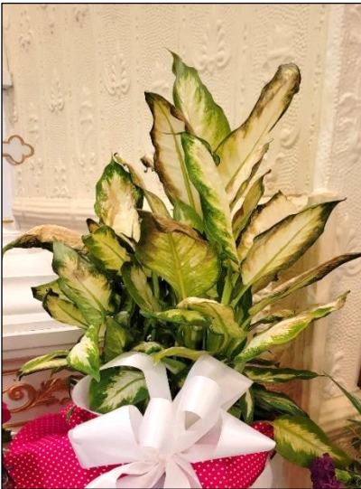
Class of 1977