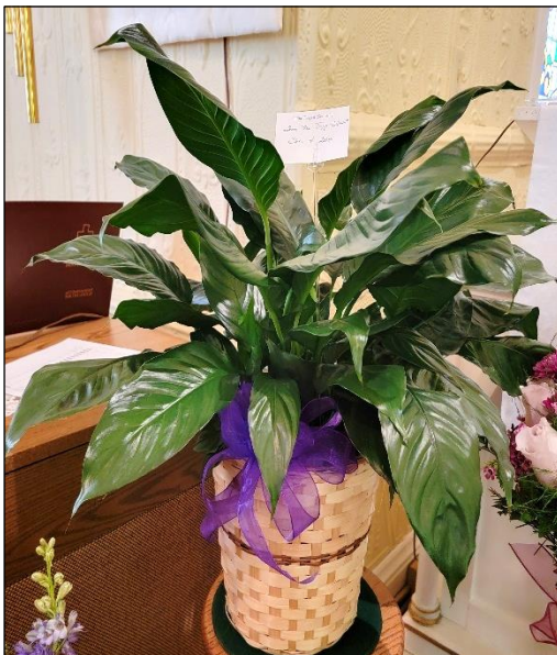
Tripp-Delmont Class of 2004