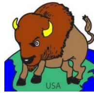
Satan Working through the USA when it speaks like a dragon Rev 13