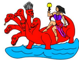
Satan Working through the Papacy's Restored Religio-Political powers during Earth's Last Days Rev 17

Our last two programs reviewed how Satan, the dragon of Revelation 12, working through Pagan Rome, transferred his power to the Papal beast of Revelation 13. But we can't forget there are two beasts in Revelation 13.