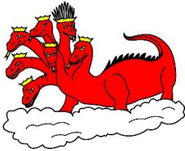
Satan Working through Pagan Rome Rev 12