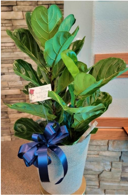
ADESA of Sioux Falls