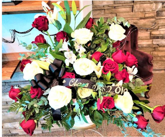
Class of 2010