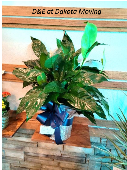
D&E at Dakota Moving