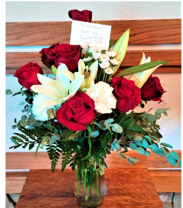
Yankton Middle School Staff