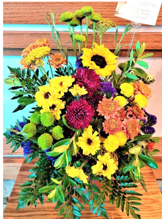
Your friends at OLM Food Solutions