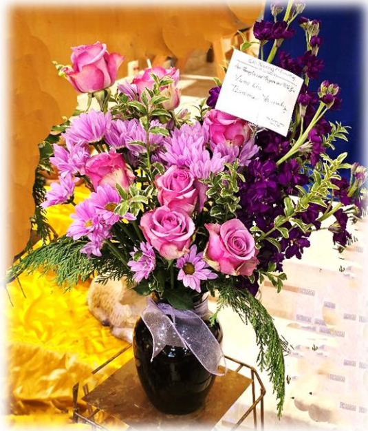
The Temme Family