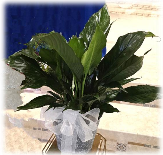
Your Avera Family