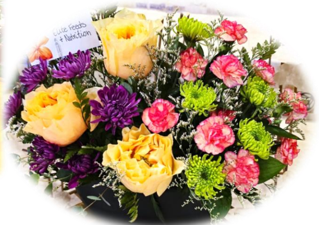
Elite Feeds & Nutrition