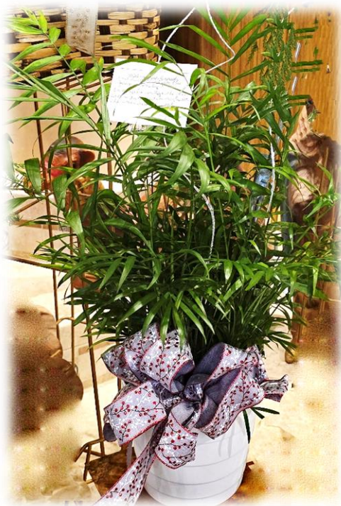
On angels wings she was taken away but in our hearts she will always stay.