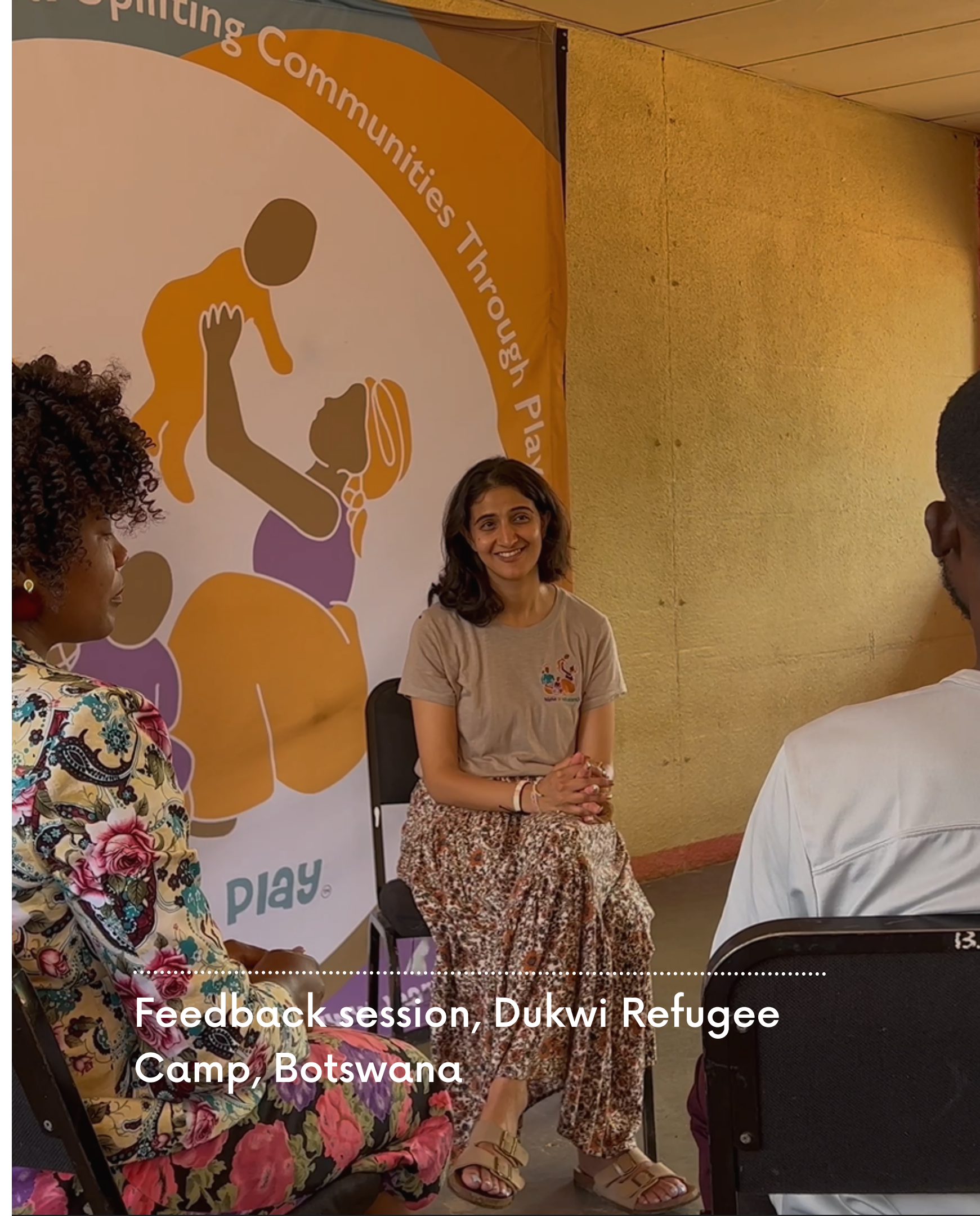
Feedback session, Dukwi Refugee Camp, Botswana

"(The Parent PlayBox) helps to develop love amongst parents and children"