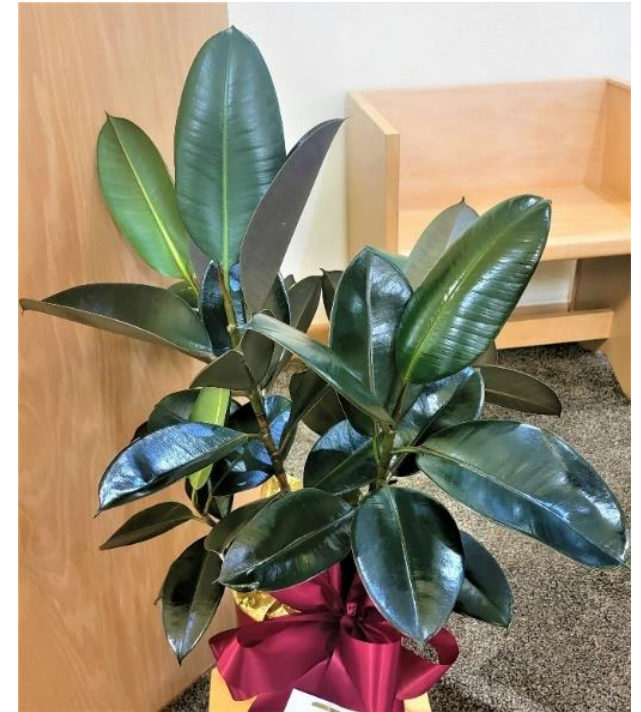
Scotland GSC Staff & Neighbors