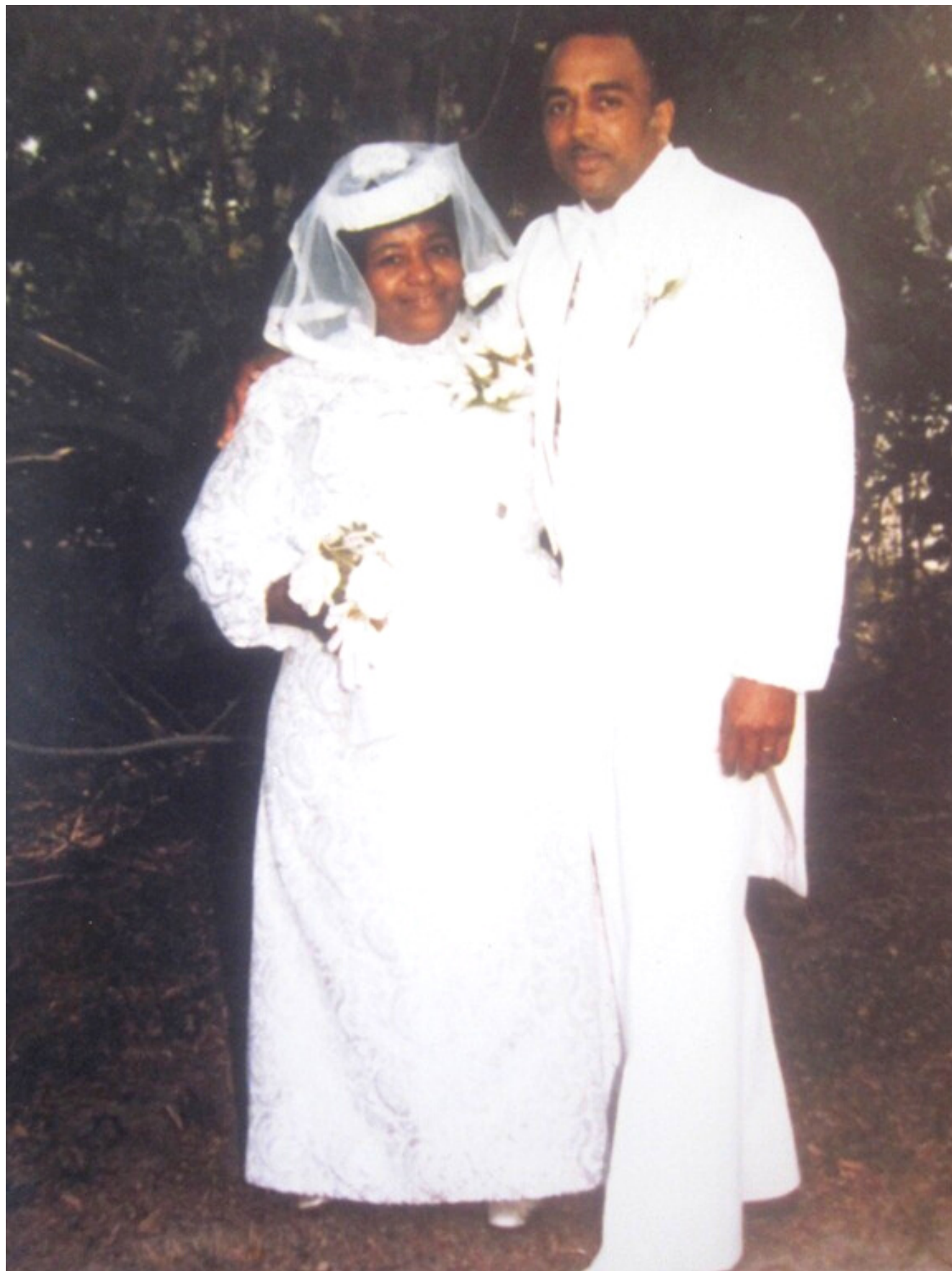
25th WEDDING ANNIVERSARY- MAY 7, 1978