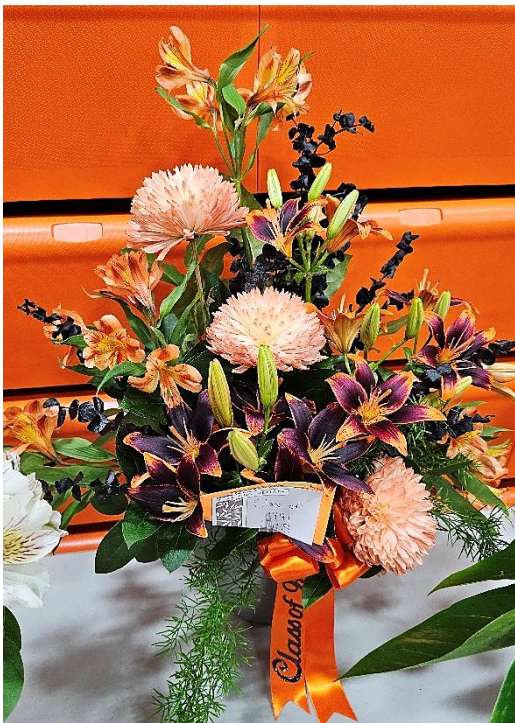
Class of 1991 SHS