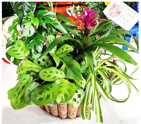
Lesterville Fire & Rescue