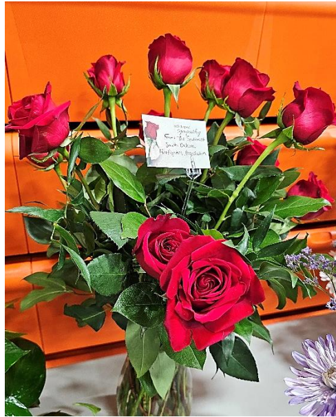
The Southeast South Dakota Firefighters Association