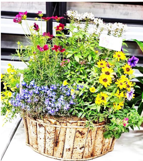
Menno State Bank