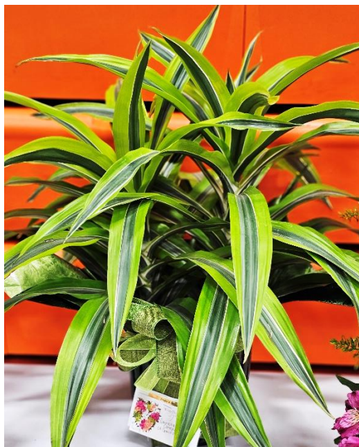
Council & Congregation of Spirit of Hope