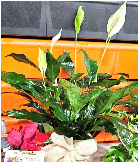
Long Prairie Packing Co.