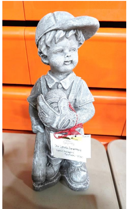
Our deepest sympathy. Menno Midgets Baseball Team