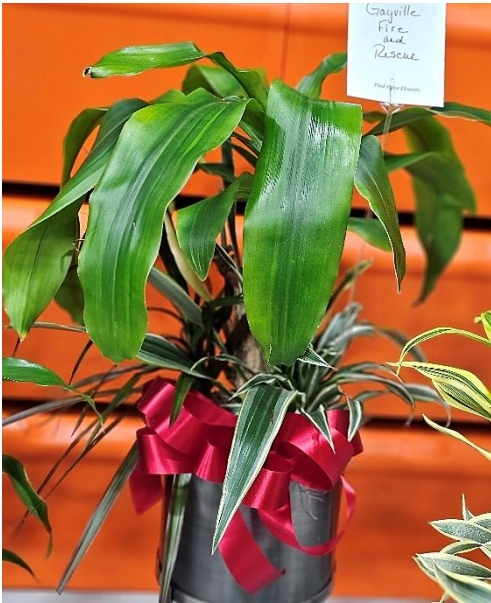
Gayville Fire and Rescue