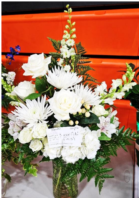
Nucor Cold Finish