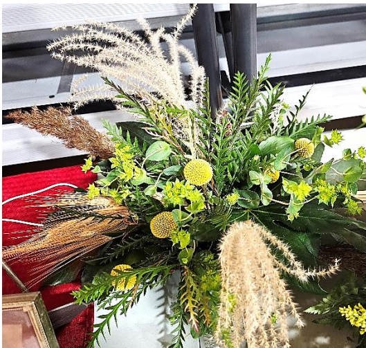
Ethan Co-op and Lumber