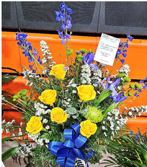
Our prayers and thoughts are with you all. Meridian Corner