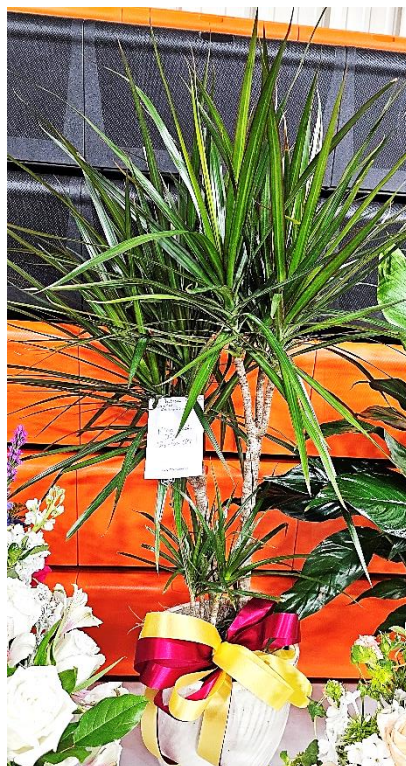
Fire and Iron Station 57