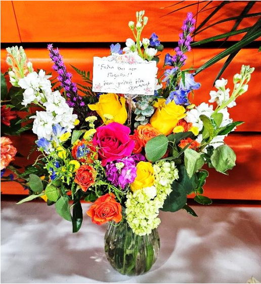
"Fallen but not forgotten" Yankton Fire Department