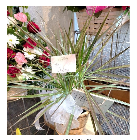
The LBW Staff