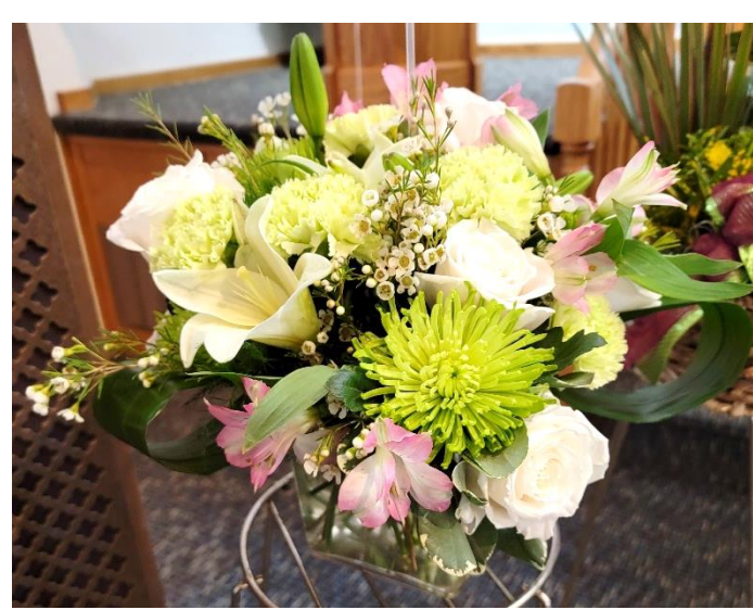
Your Yankton Avera Family