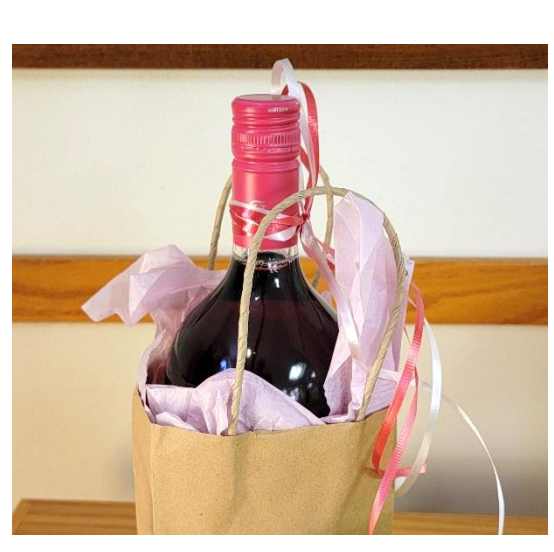
Uncle Jim & K123