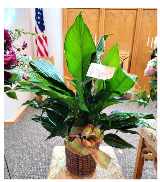
Your Avera family