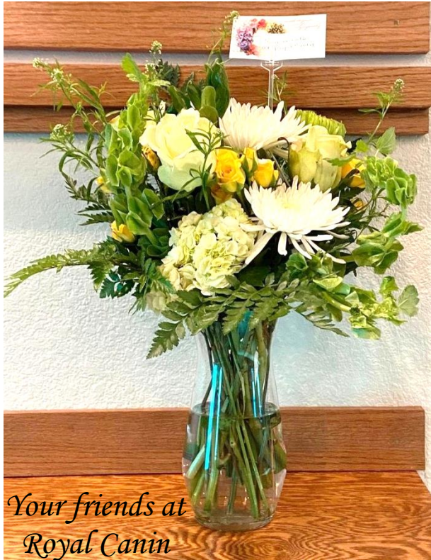
Your friends at Royal Canin