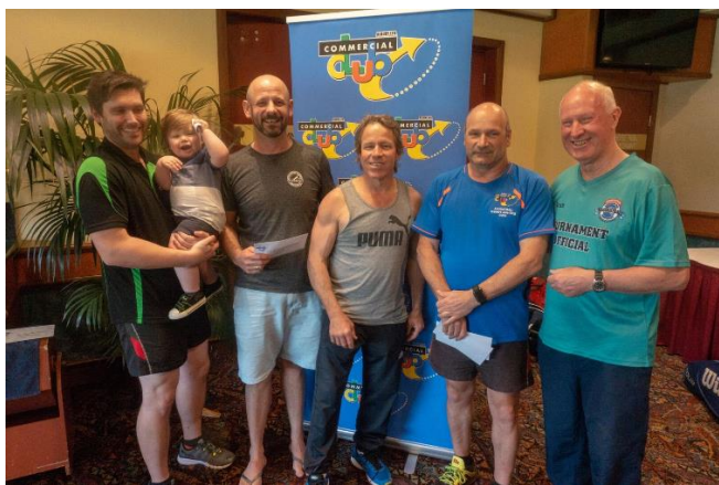
B Grade Doubles