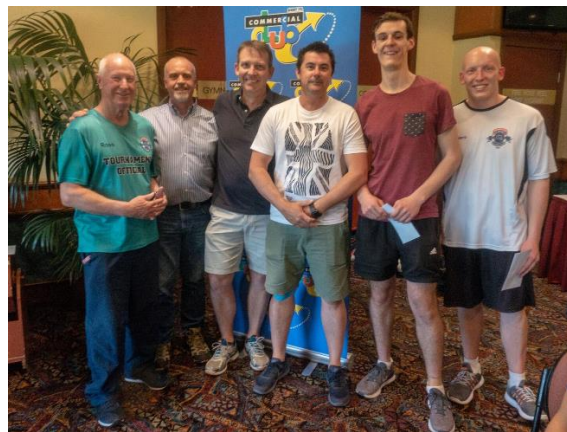
A Grade Doubles