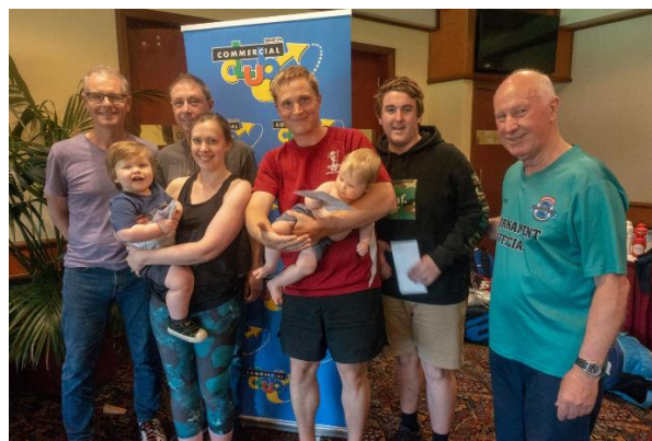
C Grade Doubles