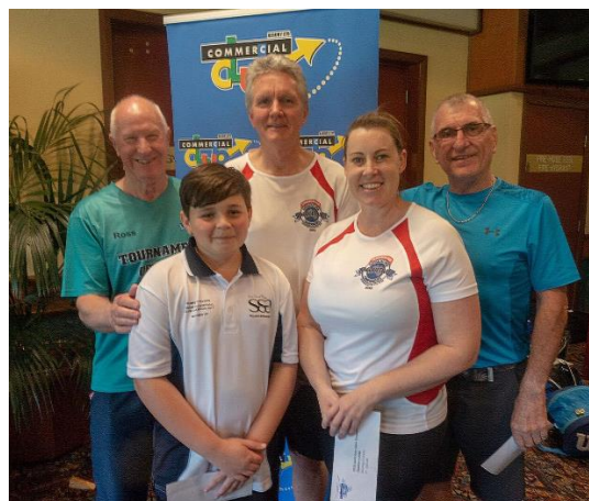
E Grade Doubles