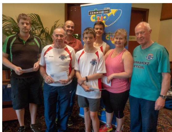
D Grade Doubles