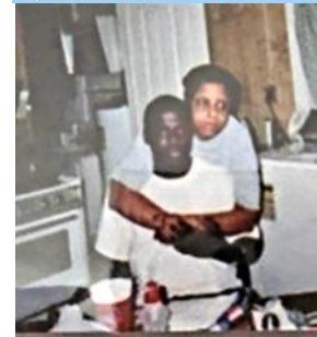
MOMA AND DADDY