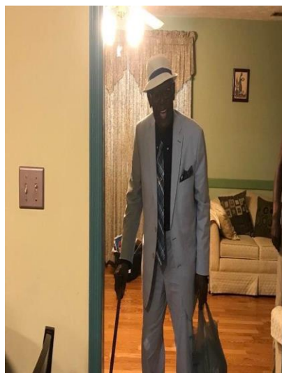
"I'm outta here!"