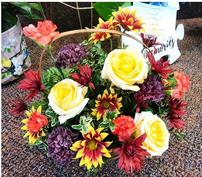
St. Michael's Hospital Avera