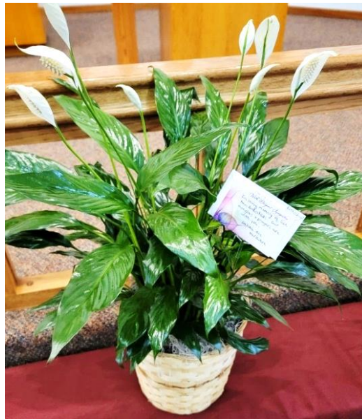
Dakota Ace Hardware