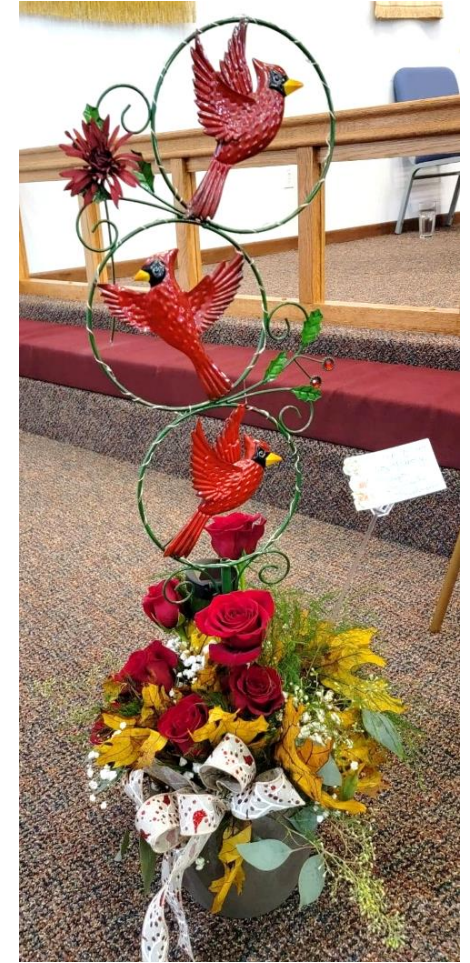
City of Viborg Mayor, Council & Employees