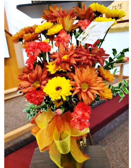
Cameron Financial Group