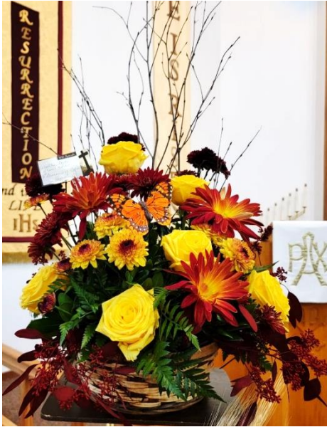
Flamming – Grimme Family