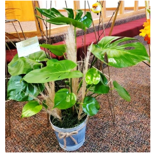
Your Department of Revenue Family