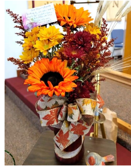
The Bargain Shoppe Board & Volunteers