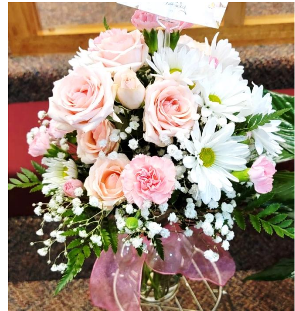
The Duncan Family