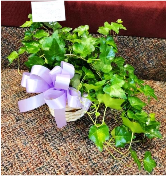
Tyndall Public Library and Library Board