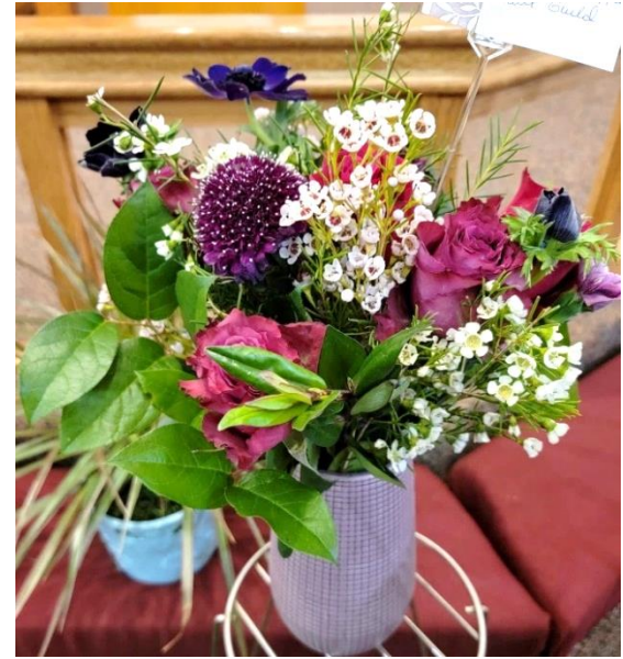
Springfield Stitch and Rippers Quilt Guild