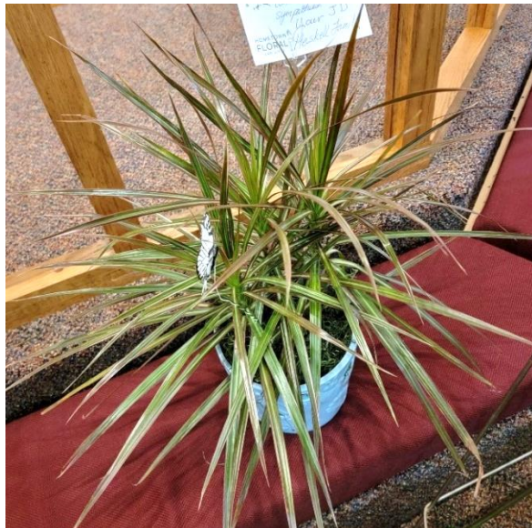
Your JD Heiskell Family