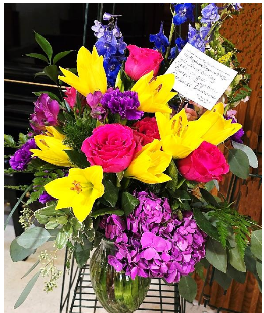
We loved having Caden in our Prosper Program Teachwell Solutions