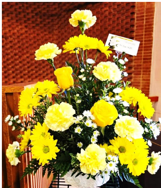
Rec Bar Staff