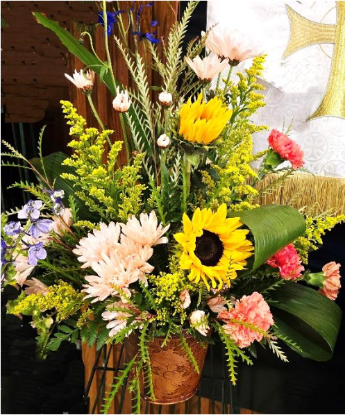
Avera Medical Group ENT & Audiology Family