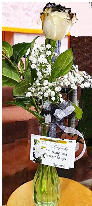
I'll always save a dance for you, Tymmarie