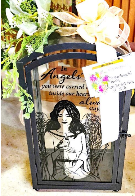
The SHS Clas of 2023