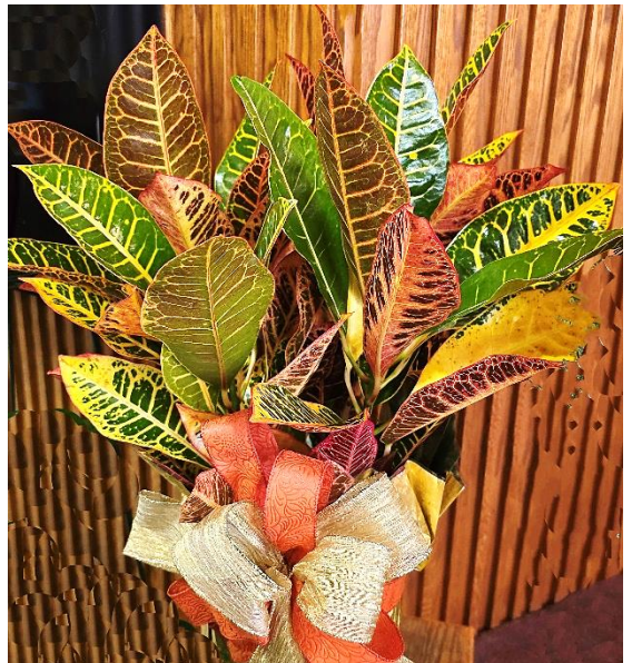
Staff and Neighbors of Scotland GSS