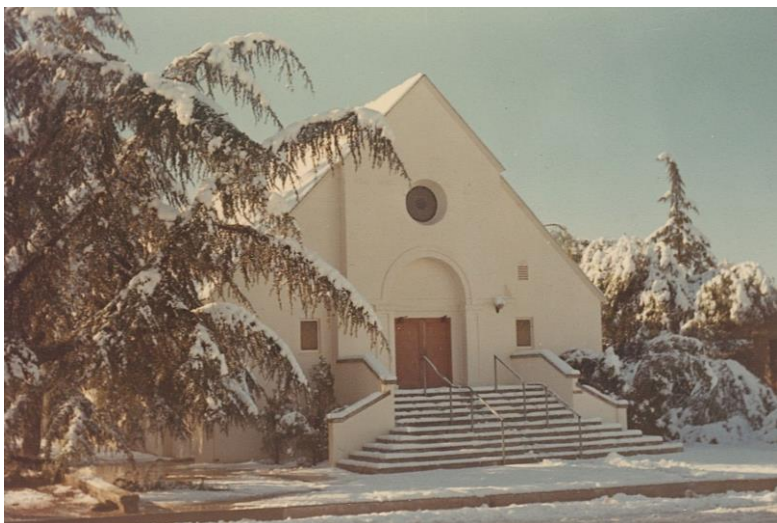
The Yucaipa SDA Church in 1964. Do you know where it was?