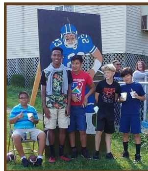
Group of students posing at the Football Toss game

Many classrooms were able to raise money