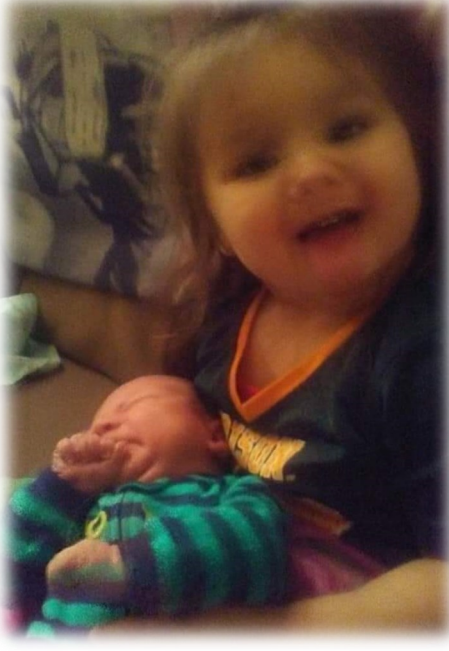
Up Above the World So High