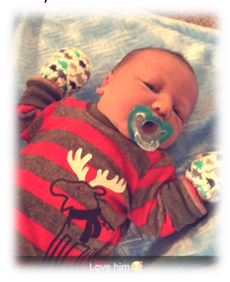
Like a Diamond

Forever In Our Hearts and Never to be Forgotten