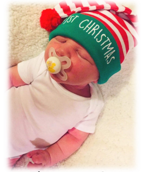
In The Sky!