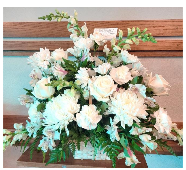
Heartfelt condolences for your family's loss. Sending prayers of healing and peace. Staff at Big Sone Therapies