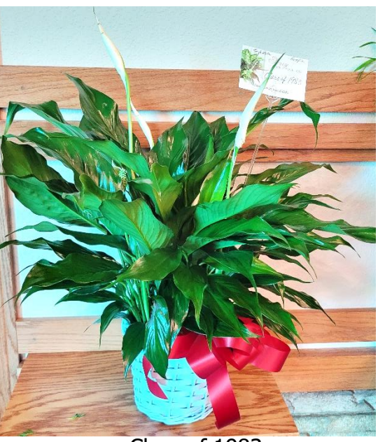
Class of 1983