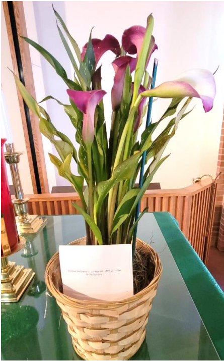
The Bride Families