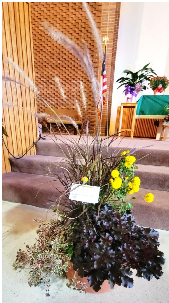
The Django's Team