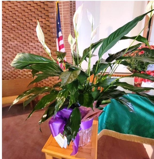
Your co-workers at RCL Wiring