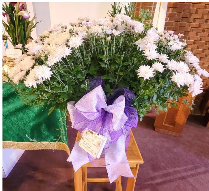
Applied Engineering & The Freeman Company