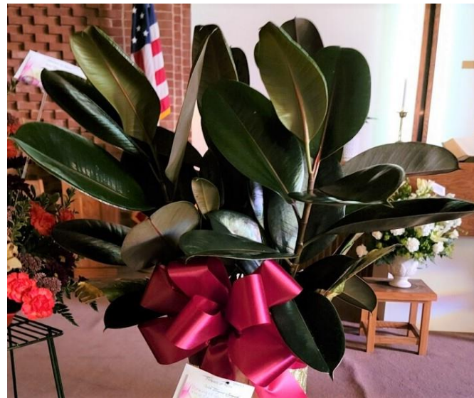
Thinking of you in your time of sorrow ~Central Farmers Coop