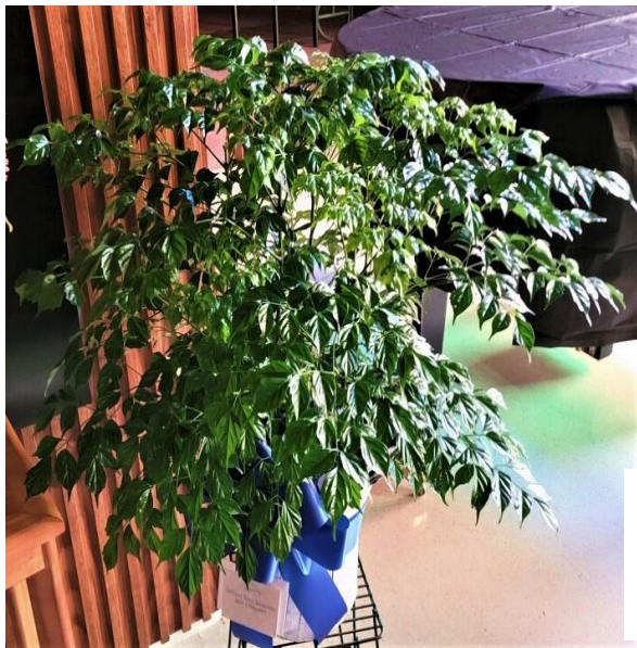
Scotland Good Samaritan Staff & Neighbors