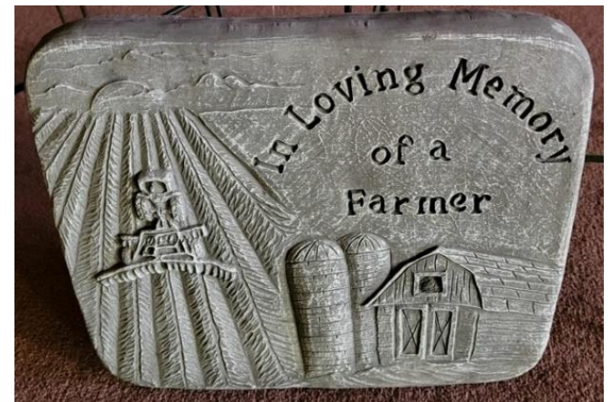
Springfield Assisted Living Residents & Staff We miss him!