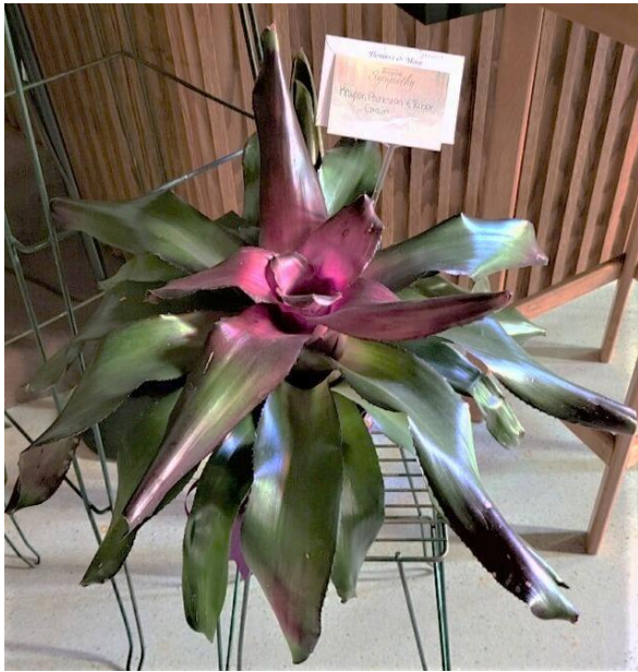
Kaylor, Parkston & Tabor Grain