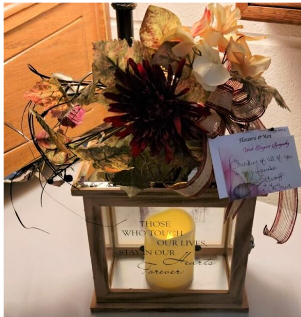
Thinking of all of you & your families