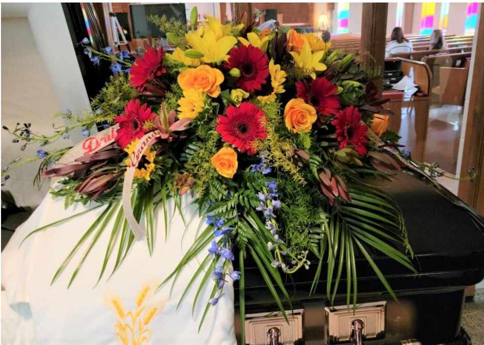
Dad ~ Grandpa