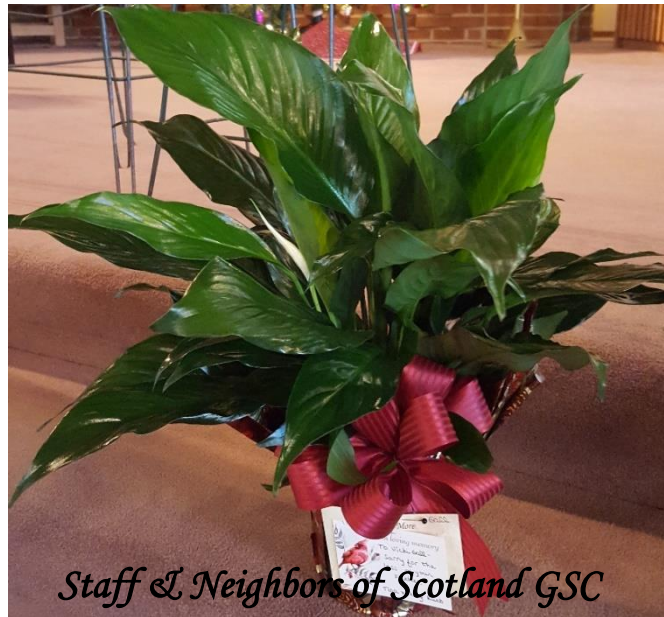
Staff & Neighbors of Scotland GSC