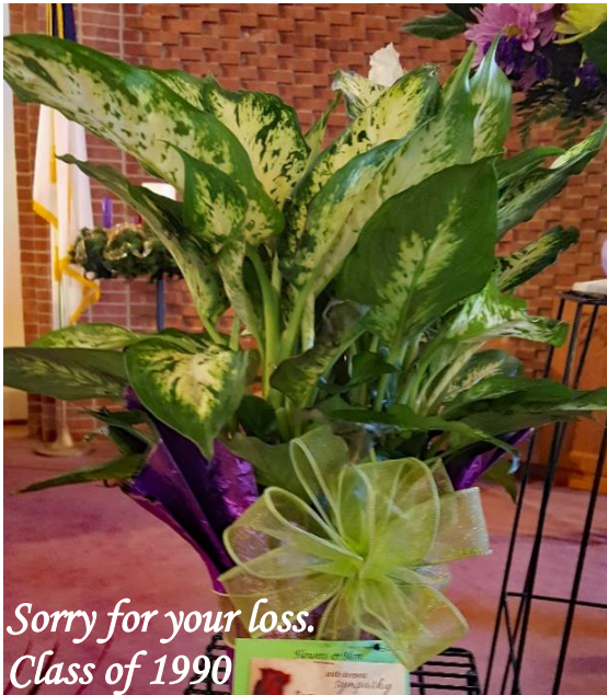
Sorry for your loss. Class of 1990