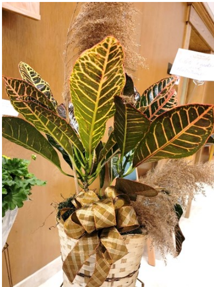
Elite Feeds and Nutrition