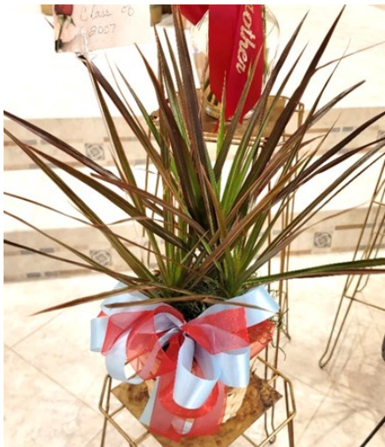
Class of 2007