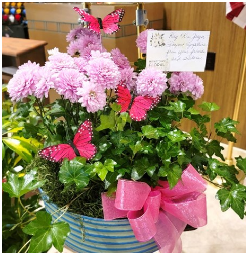
Your friends and sisters.