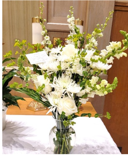
The Presentation Sisters