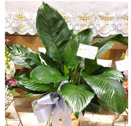
Your Life Group Friends