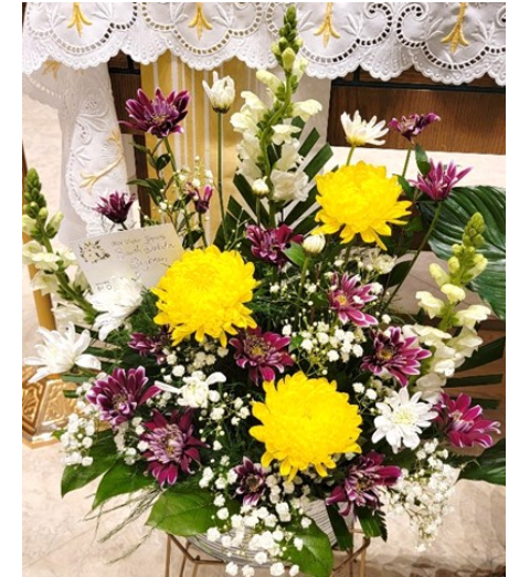
South Dakota Soybean