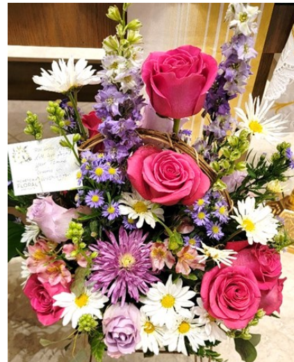
Your Temme cousins in Washington