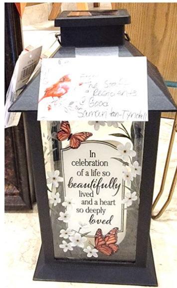
The Staff & Residents at Good Samaritan - Tyndall