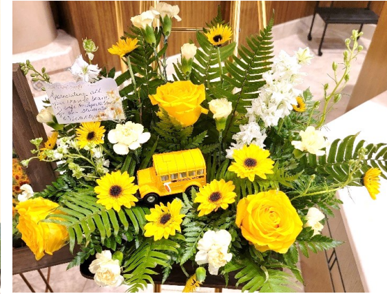
BJ School Buses