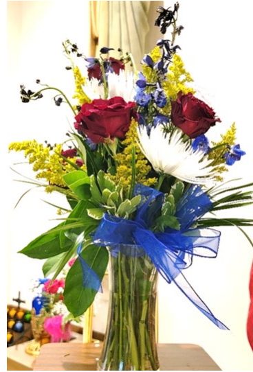
Bon Homme School District 4-2