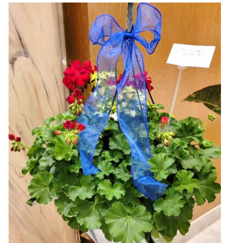
Bon Homme Democratic Party