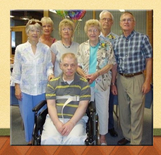
Arrangements Entrusted To HARTQUIST FUNERAL HOME