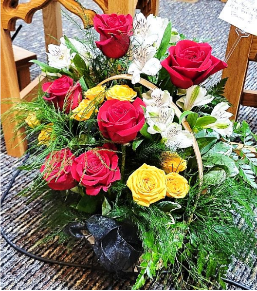
The Avon 12U and 18U Softball Teams