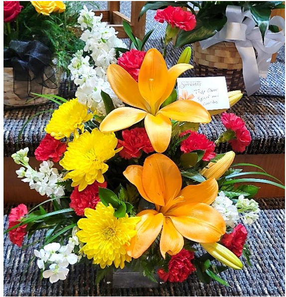
Tripp Cheer Squad and Coaches