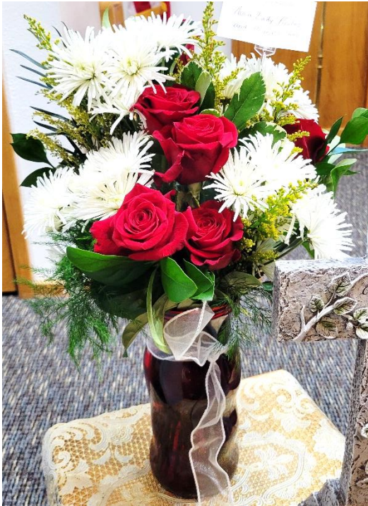
Avon Lady Pirates & their coaches