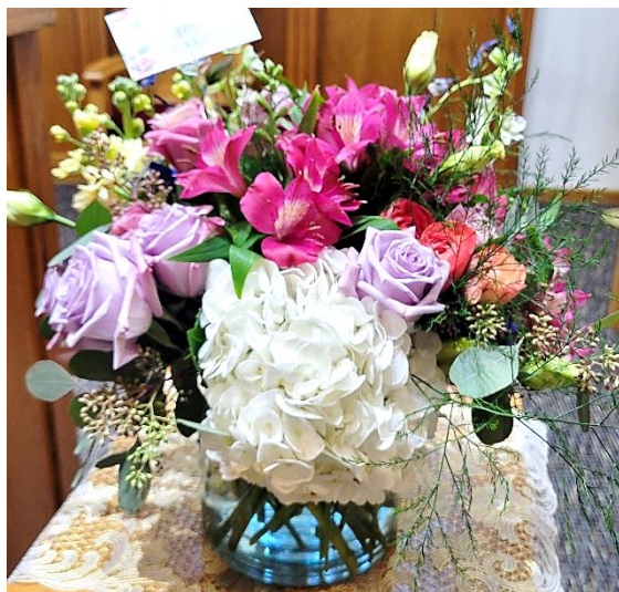
Avera McKennan ED Physicians