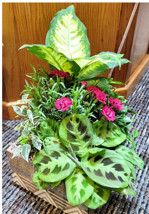
Our deepest condolences to you and your family, FRFCU Board & Staff