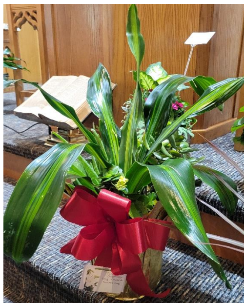
Clay & Central Farmers Coop