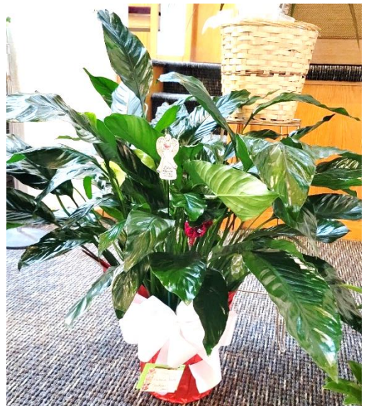
Hutchinson County Courthouse family