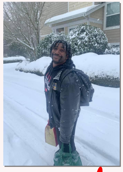
orever in our