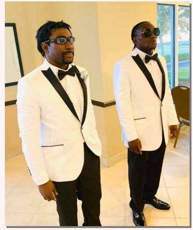
in our hearts