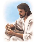
Connect Jesus with a symbol He used to describe Himself "The Bread of Life"