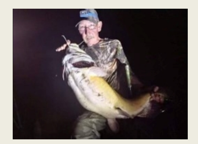
Graveside Service Crestwood Memorial Park McPherson, Kansas Tuesday, October 15, 2024, at 1:00 PM