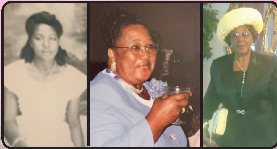
Floral Bearers Order of the Eastern Star