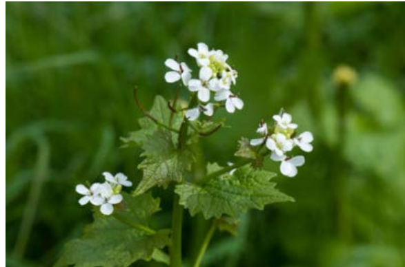
The weed Garlic Mustard is edible, plentiful in Carderock and easy to identify now because it is in bloom. It makes a great pesto!