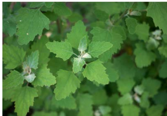
Lamb’s Quarters is also edible.