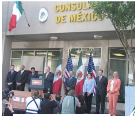
North American Leaders' Summit – Mexico - 2005