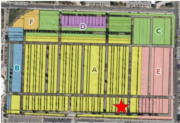
Location map of Graveside