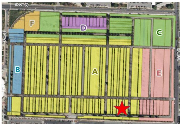
Location map of Graveside