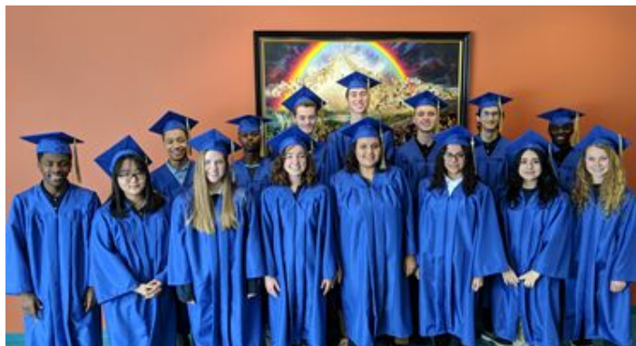
HS Seniors ready to be GRAA Alumni in a few days!