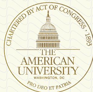
President of the University