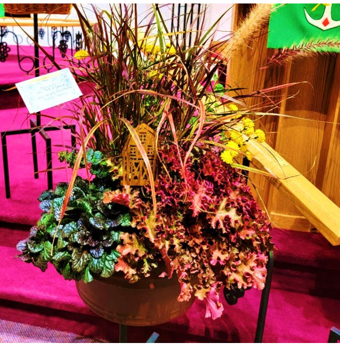
Your Wausa Elementary School Family