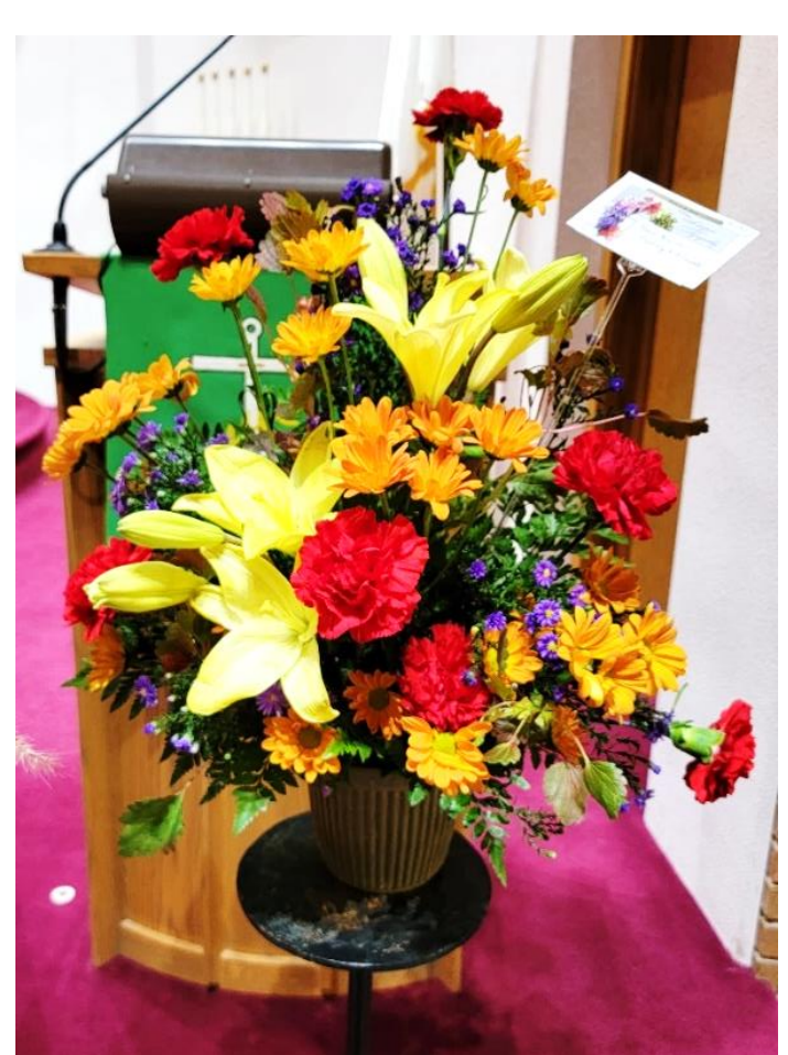
Your Nucor Family & Friends