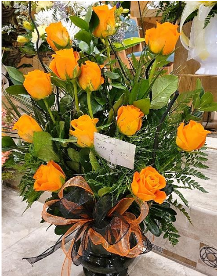
Class of 1976