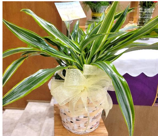
Thoughts and prayers to you, Corn Belt Educational Cooperative