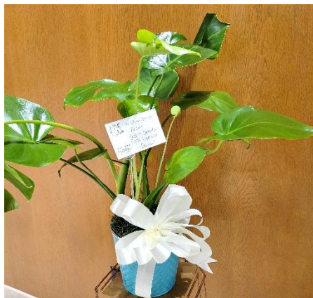
South Dakota Pork Producer Council