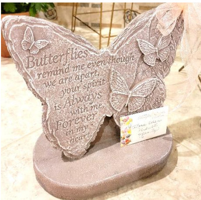
Ilene Odens Pudwill & family