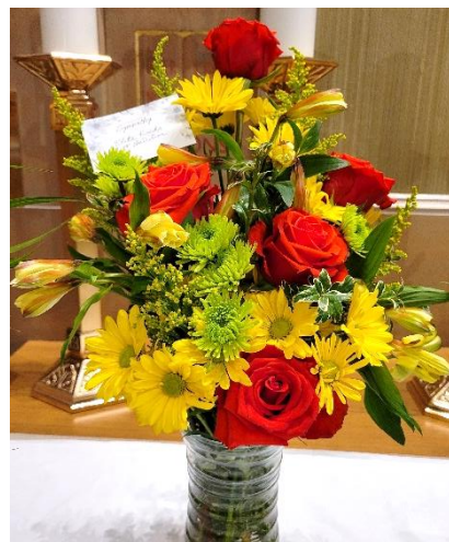
Elite Feeds & Nutrition