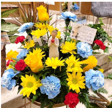
Much love, Sioux Valley First Graders