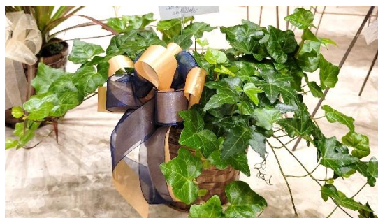
With our sympathy Sioux Valley Board & Staff