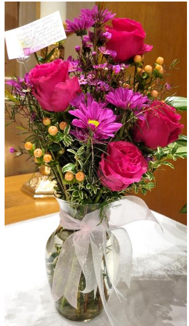
Wishing you peace, comfort, courage and lots of love at this time of sorrow.