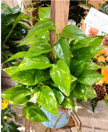
Our thoughts and prayers are with you. Your family at Security Bank