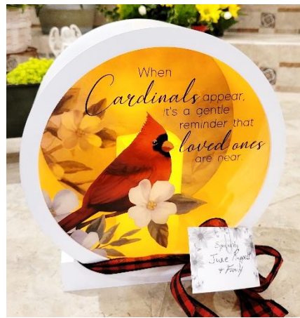
June Ruppelt & family