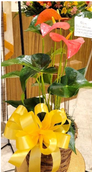
Bon Homme County Commissioners & employees and Zoning Board