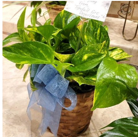
Tyndall Fire Department