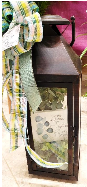
Residents and Staff Good Samaritan Society, Tyndall