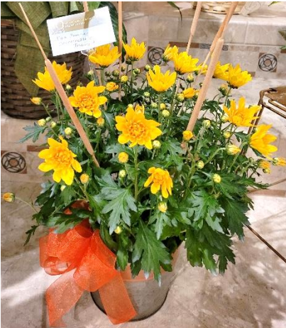
Bon Homme Conservation District