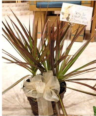
Sorry for your loss Drew Koch