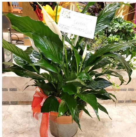
Central Farmers Coop