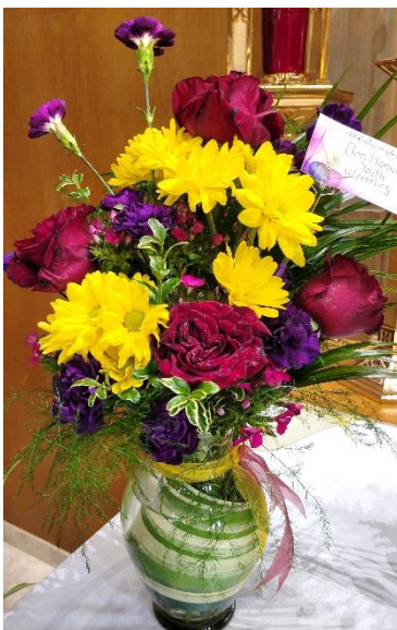
Bon Homme Youth Wrestling