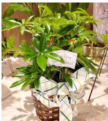
Aurora Coop, Tyndall & Mitchell