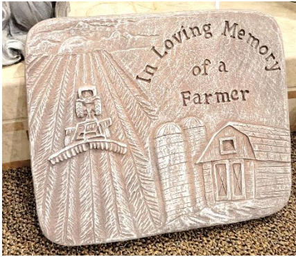
Kaylor, Parkston & Tabor Grain