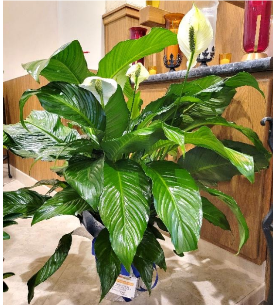
Our deepest condolences. ~Brookings Friends of Baseball