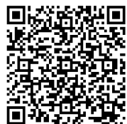
Tribute Video QR Code

Pedersen Funeral & Cremation Service Morris, MN 56267 www.PedersenFH.com