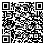
Guestbook QR Code